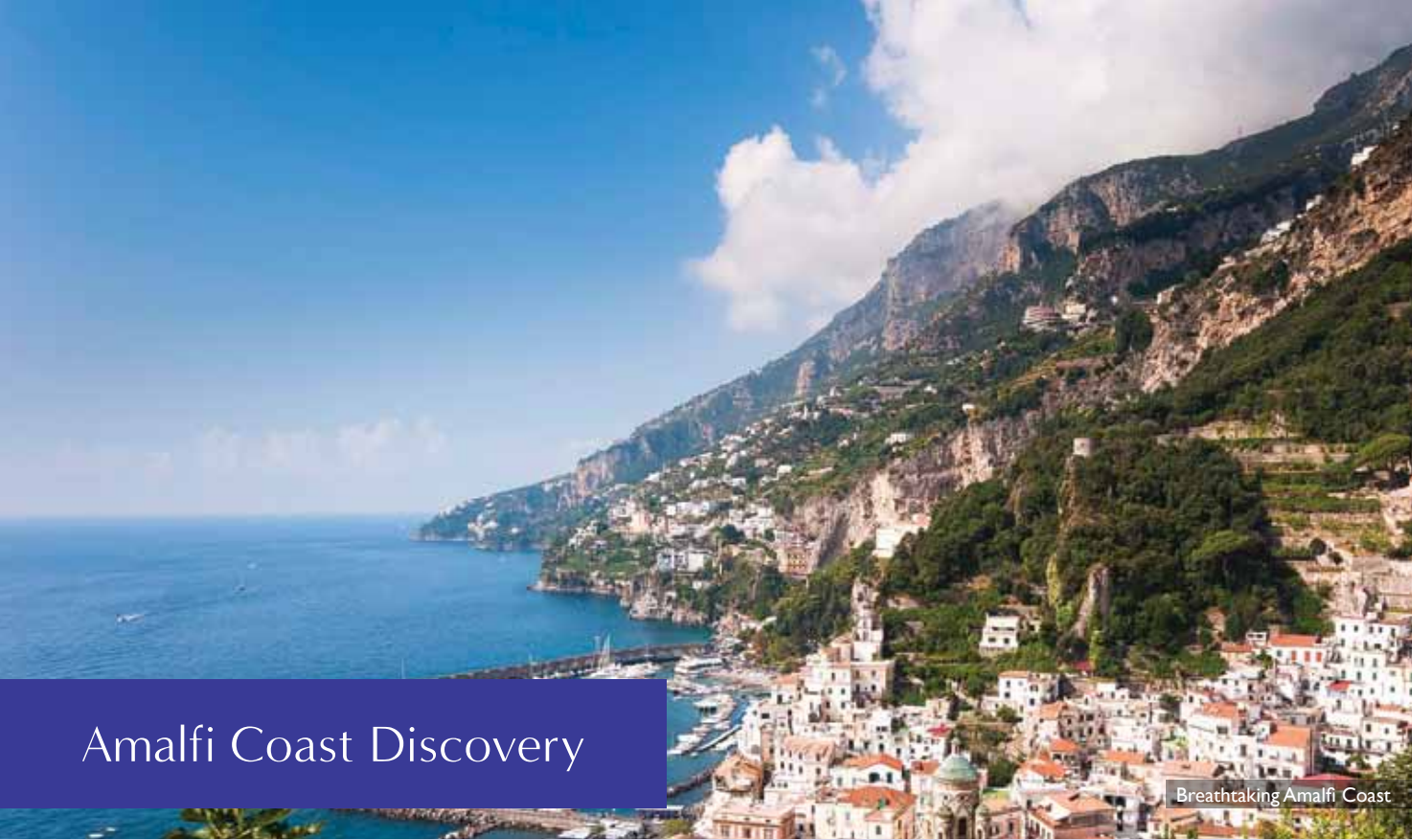
Breathtaking Amalfi Coast