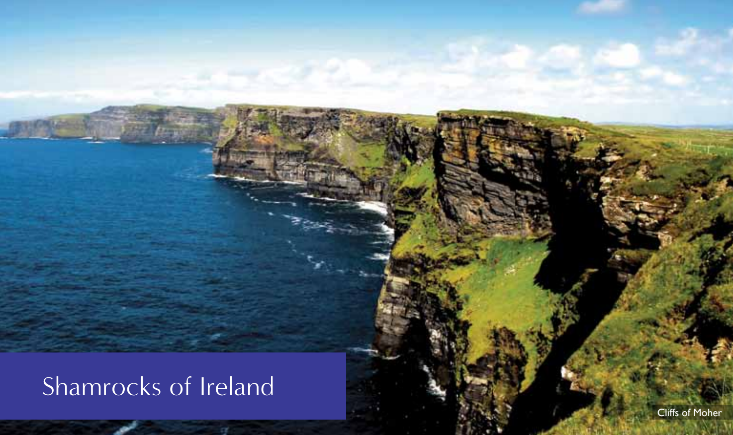
Cliffs of Moher